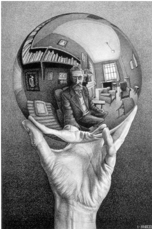
Hand with Reflecting Sphere Lithograph by M.C. Escher, 1935