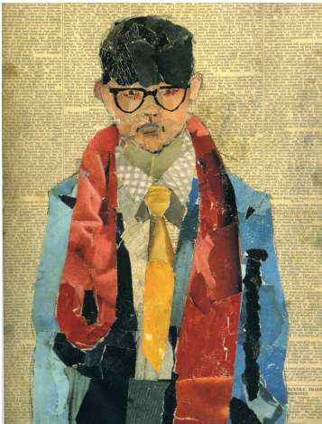
Self Portrait by David Hockney 1954

Work must be submitted by January 25, 2017 (please note the Arts Council is not open on the weekends).